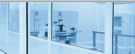
Critical Area Fogging