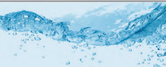
Water System Disinfection